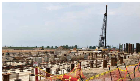
The future Rokeby Site has undergone a dramatic transformation since late 2017.