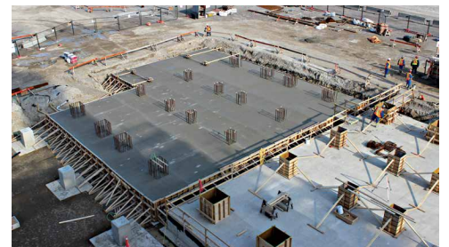
The third phase of the Corunna Cracker Expansion is progressing well.